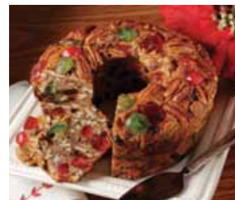
Priester's, Fort Deposit