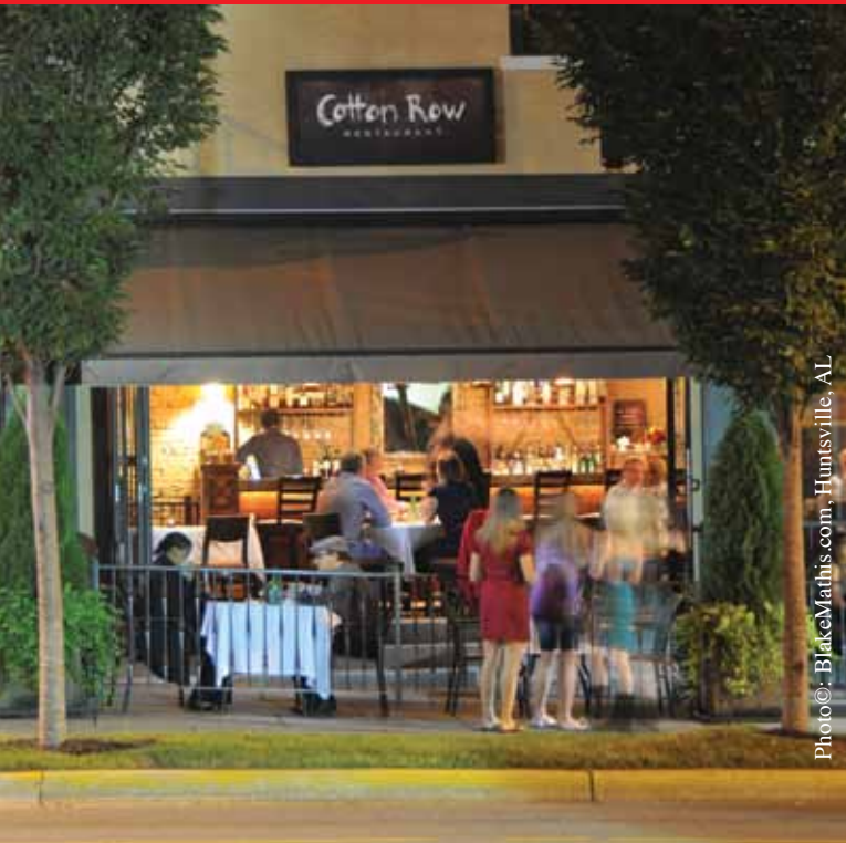
Cotton Row, Huntsville