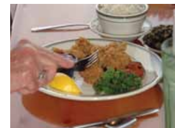
Original Oyster House, Gulf Shores