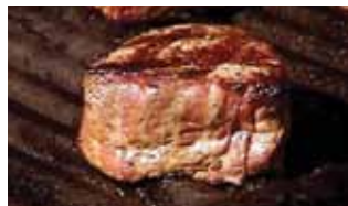
George's Steak Pit, Sheffield

Crab cakes at Fox Valley Restaurant , 205-664-8341