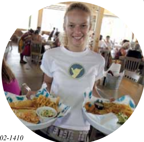
The Hangout, Gulf Shores