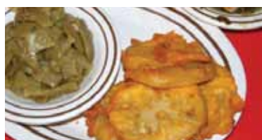
Irontdale Cafe, Irontdale

BBQ & baked beans at Golden Rule Bar-B-Q (1891), 205-956-2678 Fried green tomatoes at the Irontdale Cafe (1928), 205-956-5258