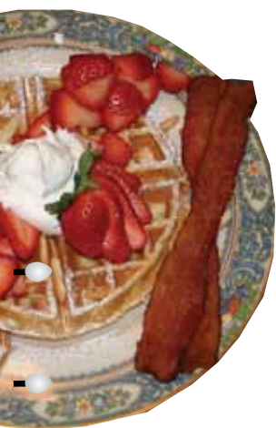
Columbus Street Inn, Fayette