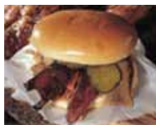
Bob Sykes BarB-Q, Bessemer