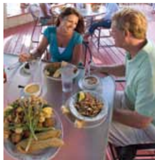
Ed's Seafood Shed, Spanish Fort